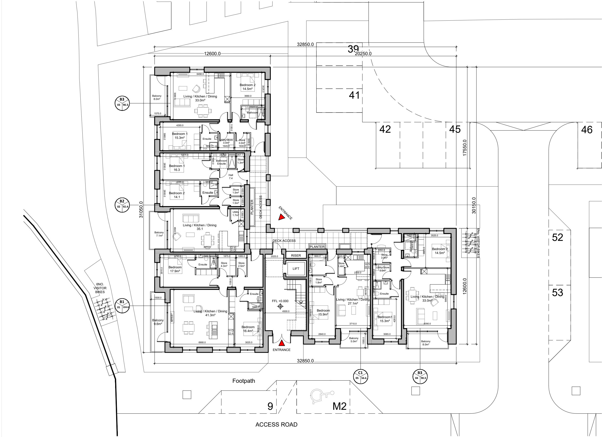
Apartment Block 01 - Ground Floor Plan Scale 1:200